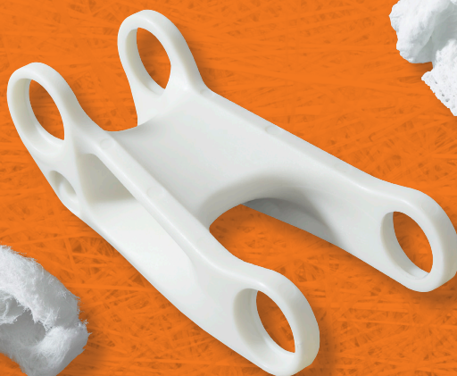
Injection molded part