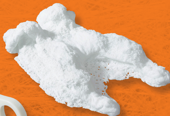
Short glass fiber