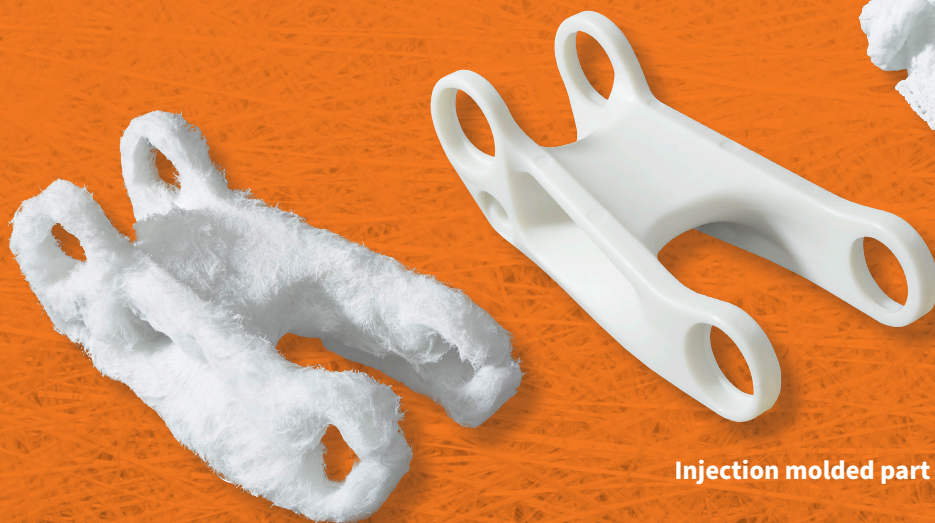
Long glass fiber

Entanglement of longer fiber filaments allows the long fiber part to retain its molded form, which provides more structural integrity and increased toughness.